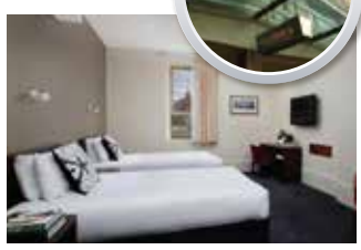
The Victoria Hotel ★★★★