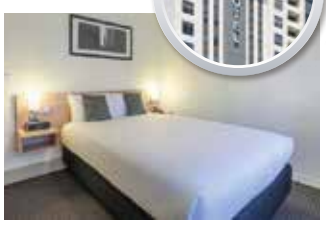
Ibis Melbourne Hotel and Apartments ★★★★